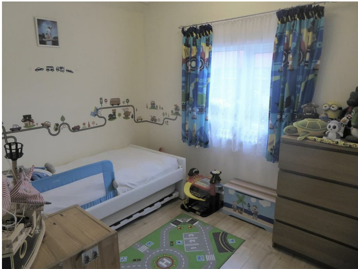
Rear aspect double glazed window, double glazed window, radiator, laminate flooring, storage cupboard.