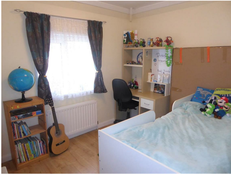
Front aspect double glazed window, radiator, laminate flooring.