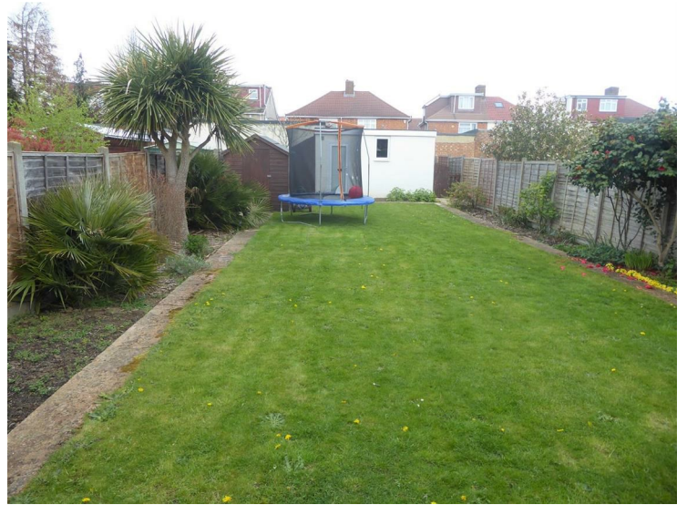
Covered paved patio area, rest mainly laid to lawn with shrub borders, side access, storage shed.